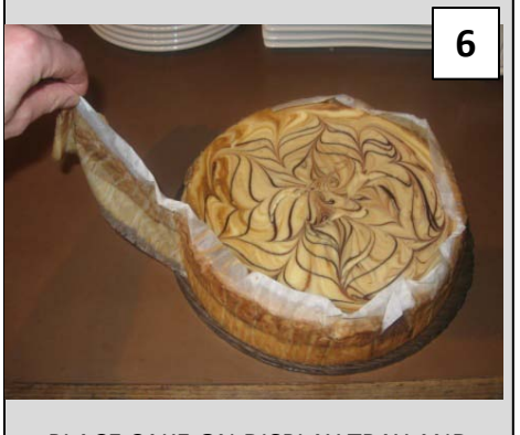
PLACE CAKE ON DISPLAY TRAY AND REMOVE WAX PAPER FROM SIDES