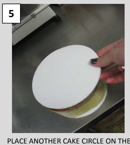
PLACE ANOTHER CAKE CIRCLE ON THE CAKE BOTTOM, AND FLIP IT RIGHT SIDE UP