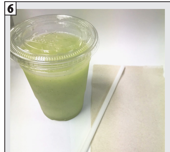
6 Serve with a straw and napkin

*You can make 2 smoothies of the same flavour at once by doubling the above measurements