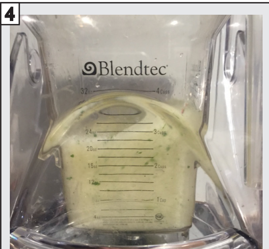
4 Place lid on blender and start blender. Non-programmable blenders run for 30-40 seconds until smooth