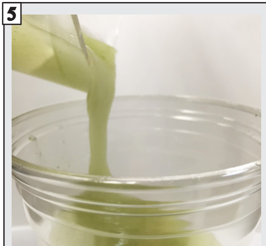
5 Pour blended smoothie into 16 oz clear cup and place a lid on top