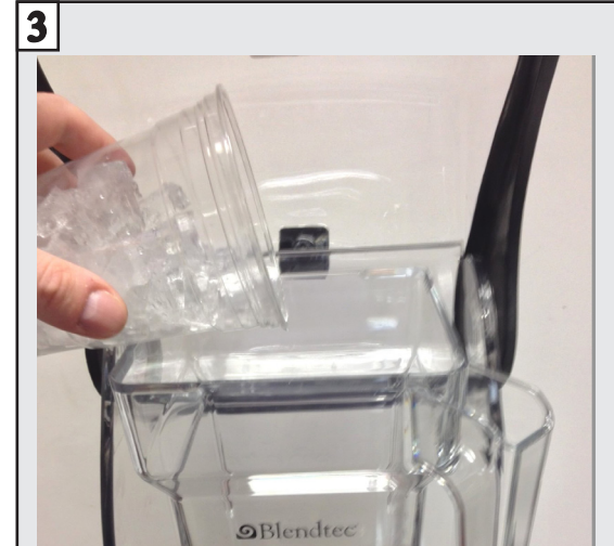
3 Measure just under one full 16 oz cup of ice and add to blender jug (amount of ice depends on cube size)